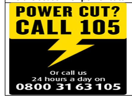
Tis the season for power cuts

Call 105 if power doesn't come back up within a short period. This will put you through to Western Power, the local electricity provider. The helpline is provided by the Energy Networks Association.